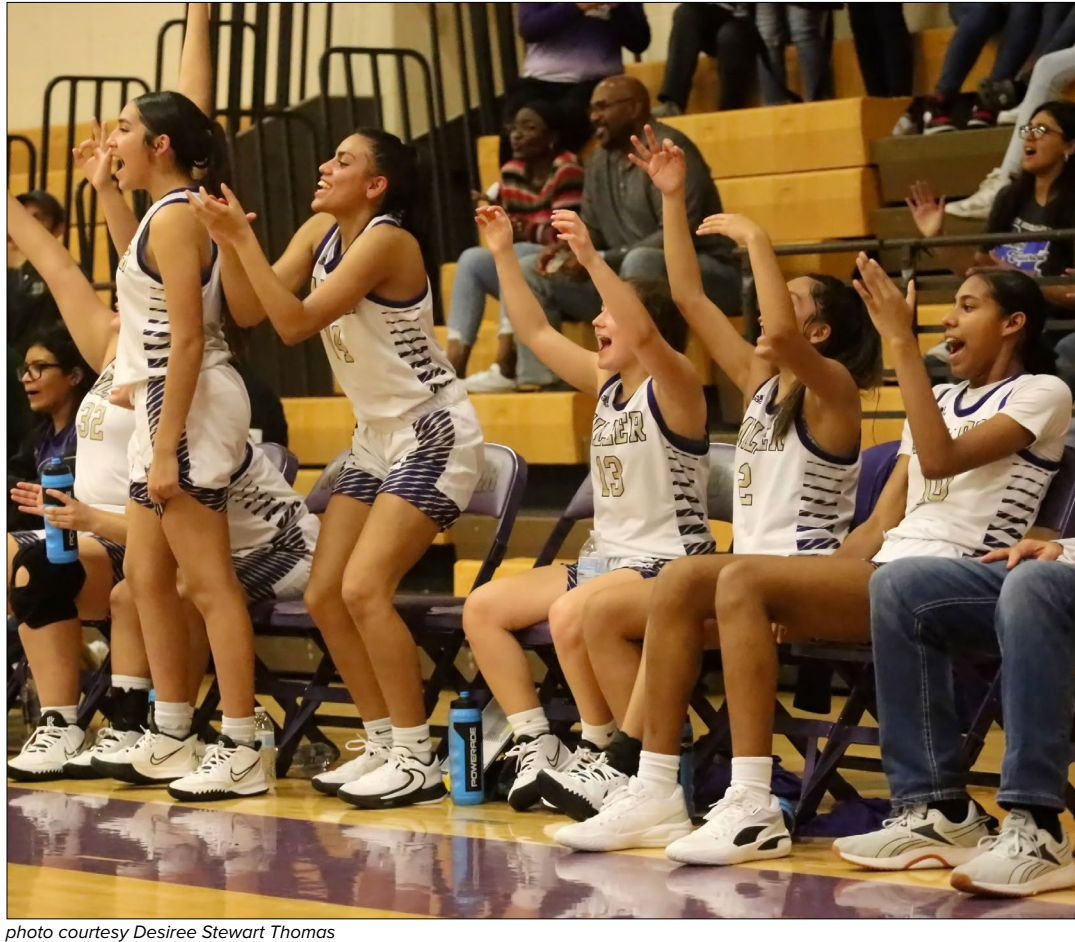
Why is this program important?

The Women of Will Program is an exclusive sponsorship for women's high school sports that celebrates overcoming any obstacle, be it mental, physical or societal. WOW strives to empower coaches with performance solutions and a comprehensive female athletics support system so that they can focus on what truly matters helping the next generation of female athletes reach their full potential. Through the WOW program, teams are provided with unparalleled resources and support from two of the leading brands in sports - BSN SPORTS and Under Armour®.